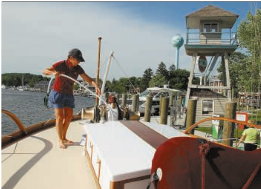
The bow of the boat gets a cleaning while docked at Snug Harbor