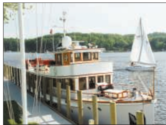
Below: A sailboat passes near the Canim docked at Snug Harbor.