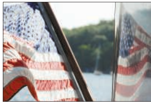
The flag at the stern blows as Capt. Luther Hall cleans the deck of the boat while docked in Pentwater.