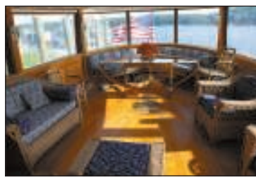
A look toward the stern from inside.